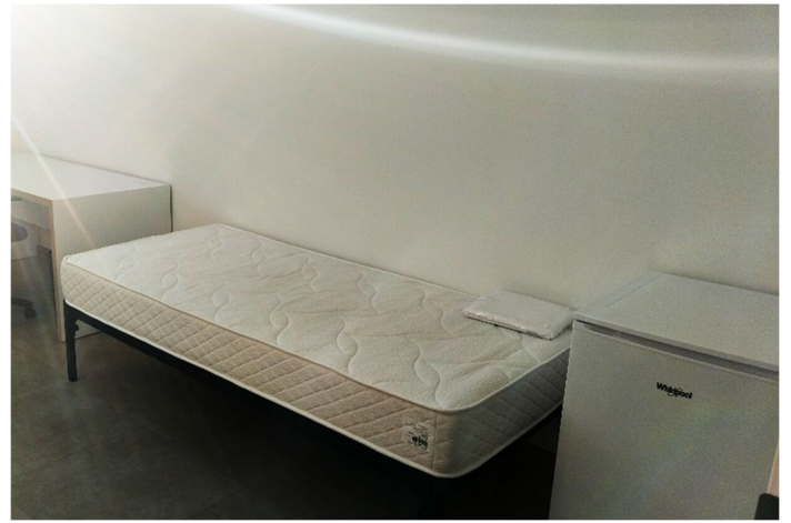
Room with bedframe, desk, wardrobe, washbasin, mirror and fridge Room with bedframe, desk, wardrobe, washbasin, mirror and fridge