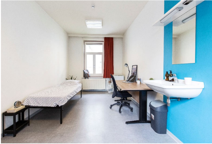
Room with bedframe, desk, wardrobe, washbasin, mirror and fridge