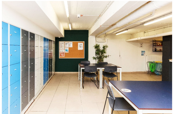
This is the dining area, next to the kitchen and living room