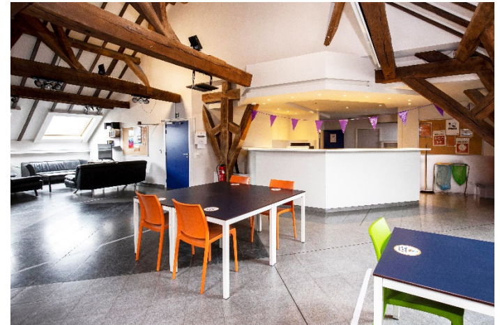
Shared common living room in Savaan House