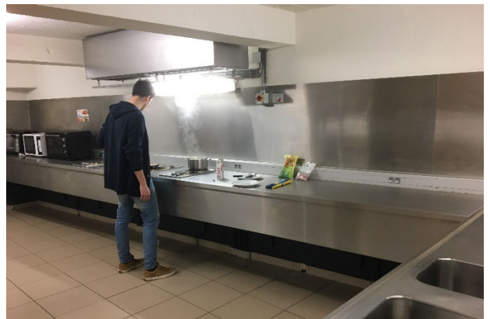
There's a large shared kitchen in the basement