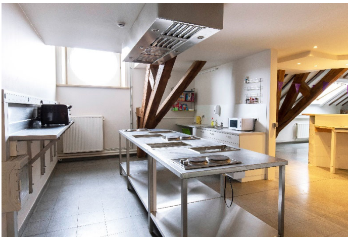
Shared kitchen in Savaan House