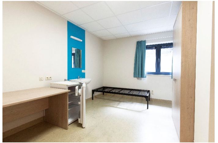
Equipped room (desk, bedframe, wardrobe, fridge)