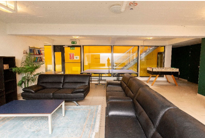
This is the common living room, next to the kitchen and dining area