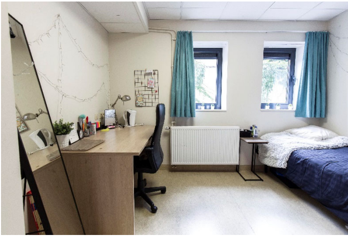
Equipped room (desk, bedframe, wardrobe, fridge)