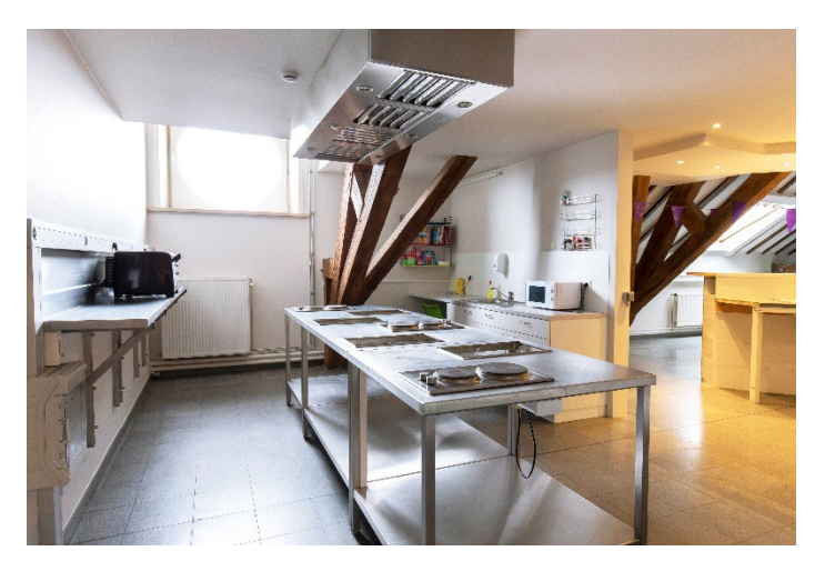
Shared kitchen in Savaan House