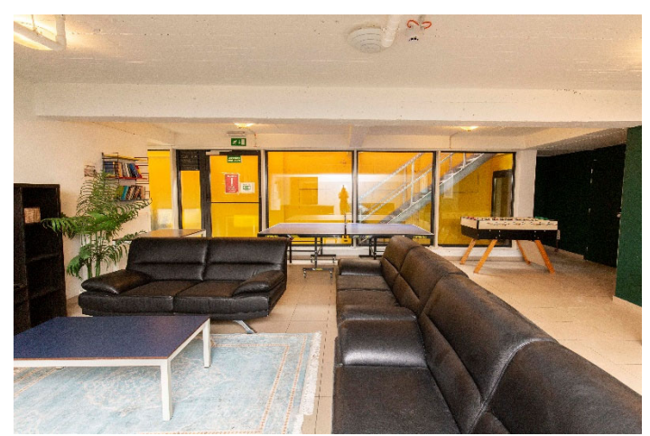
This is the common living room, next to the kitchen and dining area This is the dining area, next to the kitchen and living room