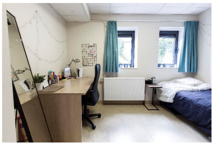
Equipped room (desk, bedframe, wardrobe, fridge)