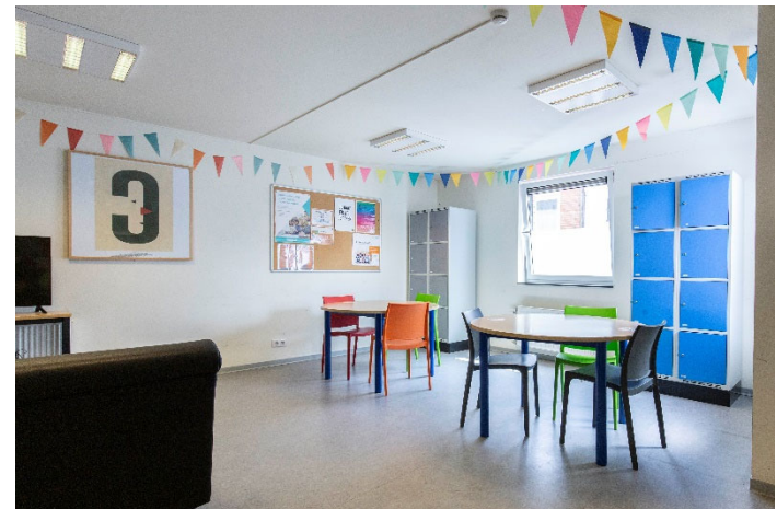
Shared kitchen with living and relaxing area on every floor in Jeruzalem House