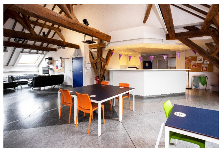
Shared common living room in Savaan House