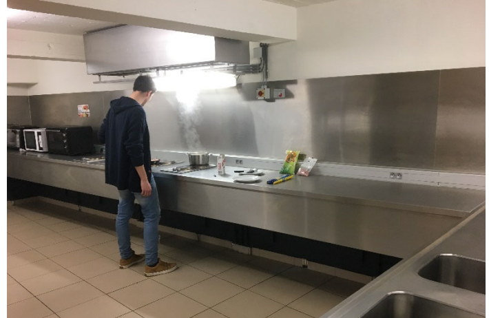
There's a large shared kitchen in the basement