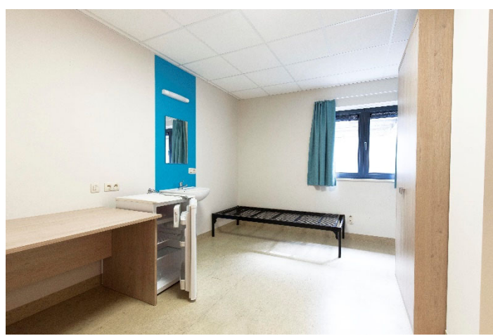
Equipped room (desk, bedframe, wardrobe, fridge)