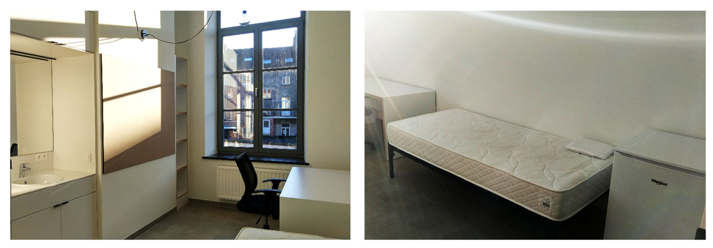
Room with bedframe, desk, wardrobe, washbasin, mirror and fridge Room with bedframe, desk, wardrobe, washbasin, mirror and fridge